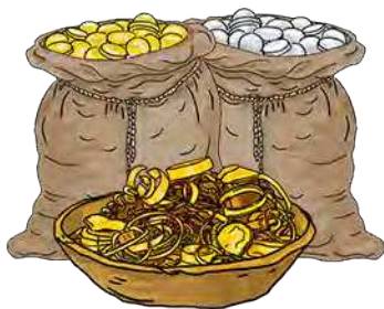
sacks of gifts