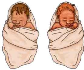
Esaw & Ya'aqob