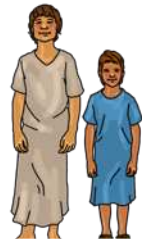
Zilpah's 2 sons