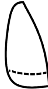
LEFT ARM LIGHT PURPLE