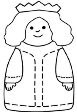
QUEEN ESTER TEMPLATE FOR FELT PUPPET