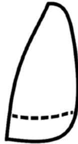
RIGHT ARM LIGHT PURPLE