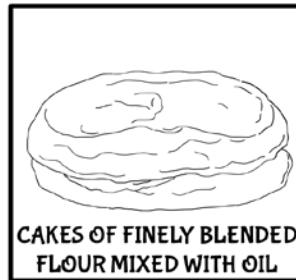
CAKES OF FINELY BLENDED FLOUR MIXED WITH OIL