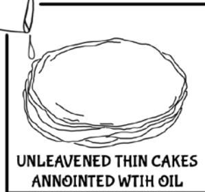
UNLEAVENED THIN CAKES ANNOINTED WITH OIL