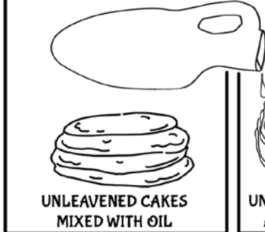
UNLEAVENED CAKES MIXED WITH OIL