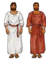
Merari's 2 sons

4. Who supervised the Qeathites? (4:15-16)