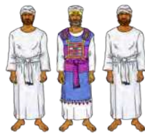
Ithamar, Aharon, El'azar