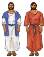
Gershon's 2 sons

3. Who covered the set-apart objects? (4:15)