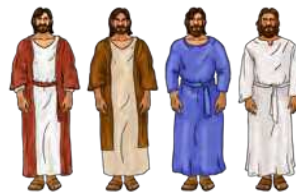
Qeath's 4 sons