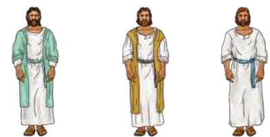
Qehathithes Gershonites Merarites