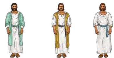
Qehathithes Gershonites Merarites