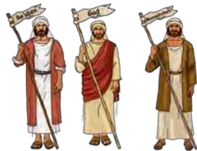
Re'uben, Gad & Menashsheh

2. Which tribes were on the east side of the Yarden? (34:14-15)