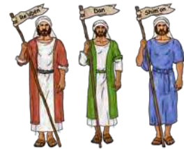
Re'uben, Dan & Shim'on

3. How many cities were cities of refuge? (35:6)