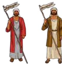
Ephrayim & Menashsheh