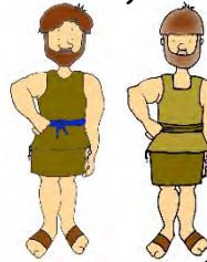
Ephrayim & Menashsheh