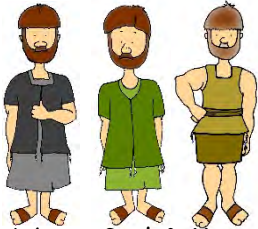
Re'uben, Gad & Menashsheh

2. Which tribes were on the east side of the Yarden? (34:14-15)