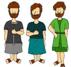
Re'uben, Dan & Shim'on

3. How many cities were cities of refuge? (35:6)