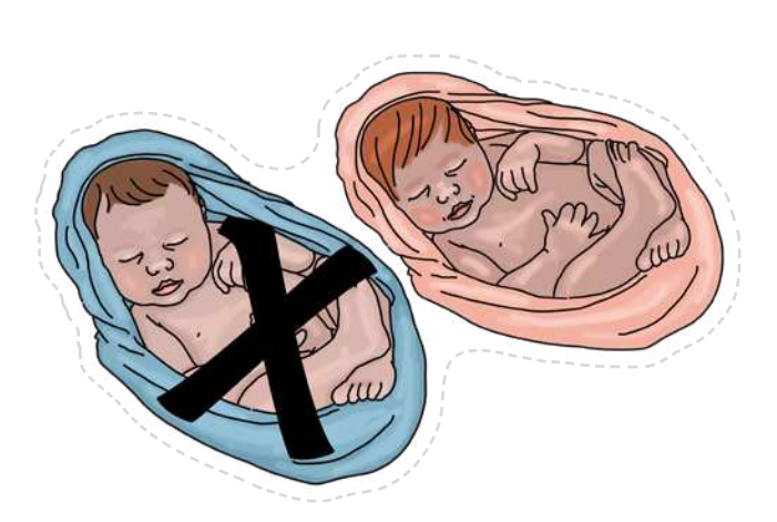
Baby boy with 'X' and baby girl