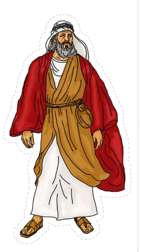
Pu'ah with family