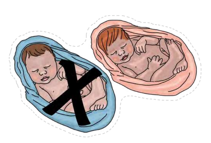
Baby boy with 'X' and baby girl