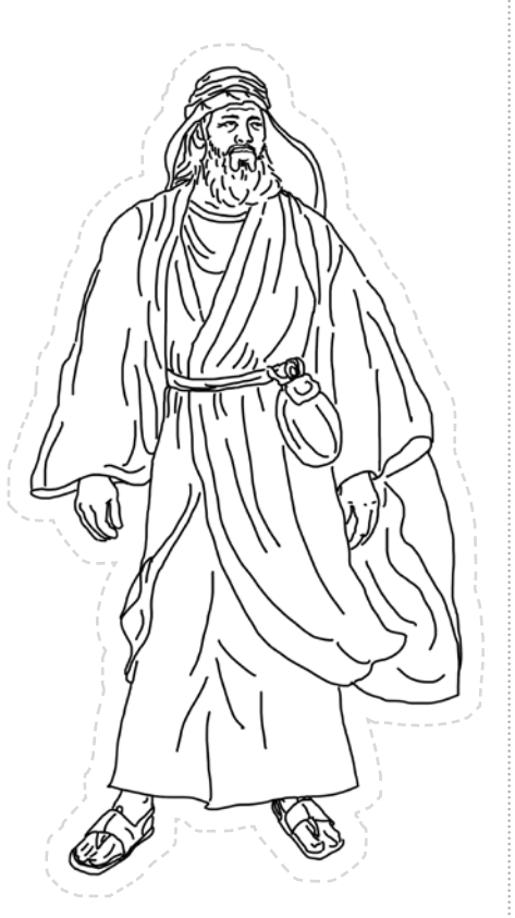
Pu'ah with family