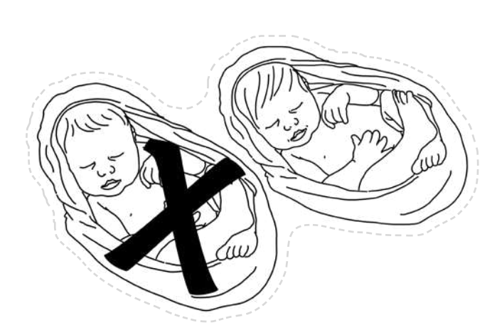
Baby boy with 'X' and baby girl