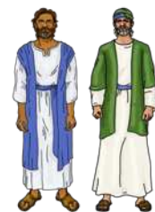
Aharon and Hur