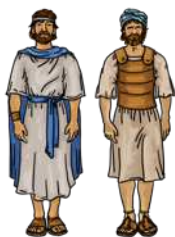
Yehoshua and Kaleb

5. Who supported Mosheh's hands when they got tired? (17:12)