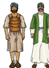
Yehoshua and Hur