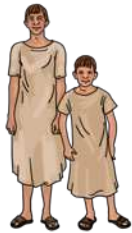
Gereshom & Eliezer